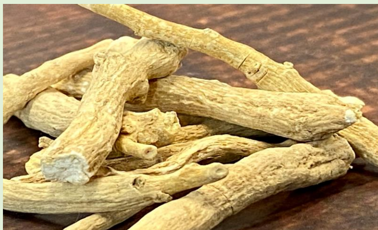
Fig.4 Ashwagandha root

In Ayurvedic medicine, winter cherry, or ashwagandha, is frequently utilized as a medicinal herb. It can balance skin moisture and is calming and rejuvenating for the skin. Its strong antioxidant content helps to maintain the vibrancy of your complexion while shielding it from free radical damage. To maintain your skin hydrated and healthy, mix one teaspoon of ashwagandha powder with rosewater and apply it to your skin! It penetrates the skin during massages and nourishes it from the inside out. [19]