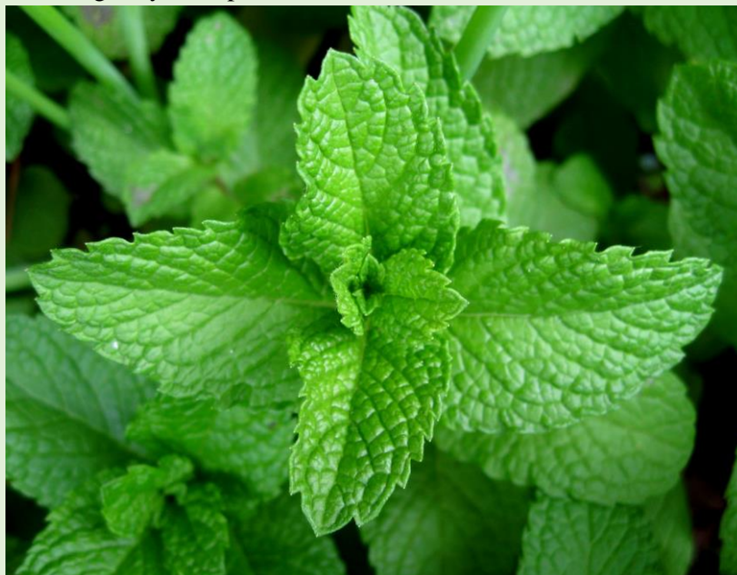
Fig.8 Peppermint oil.

Peppermint oil makes your skin appear more radiant, healthy, and youthful. Menthol, which is included in peppermint essential oil, has an instantaneous calming effect that is ideal for treating rosacea, greasy skin, puffiness, and inflammation. [22]