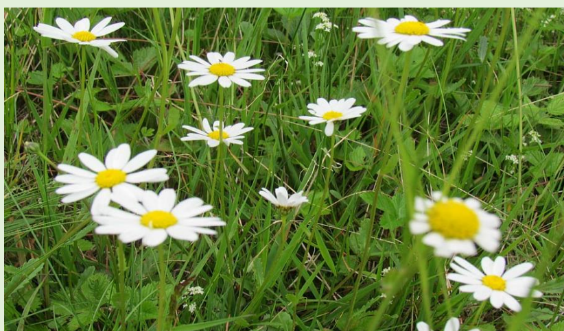
Fig.3 Chamomile flower.

Antibacterial, anti-inflammatory, and antiseptic properties found in chamomile can offset irritations to the skin. Alpha-bisabolol, a potent compound found in the herb, has the potential to enhance the skin's innate healing mechanism. A steam facial performed at home with chamomile tea leaves in a basin of hot water can help to improve the moisture content of your skin. Chamomile can diminish the development of wrinkles. It also heals skin irritations like burns and acne faster. [23]