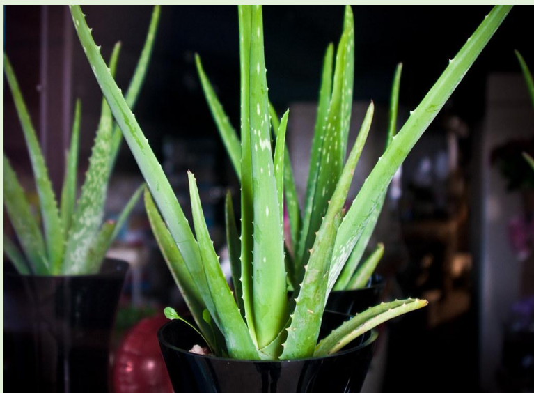
Fig.2 Aloe Vera.

Aloe vera gel can be applied to dry hands or feet, and the affected region can be covered with a sock or glove. It might be more convenient for people to apply the gel right before bed and leave it there all night. [17]