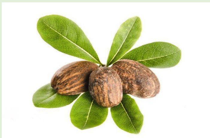
Fig.6 Shea nuts.

Shea butter is a fat extracted from the nut of the African shea tree. It is a fantastic option for the maintenance of dry skin because of its nourishing and protecting properties. Shea butter's nutrient-rich wetness causes dry skin to respond immediately, becoming more elastic and capable of retaining moisture. Shea butter is an excellent natural skin care product for dry, cracked, and flabby skin because it improves the texture and elasticity of dry skin when used regularly. Both babies and children can use this oil as a great moisturizer for delicate skin. [20]